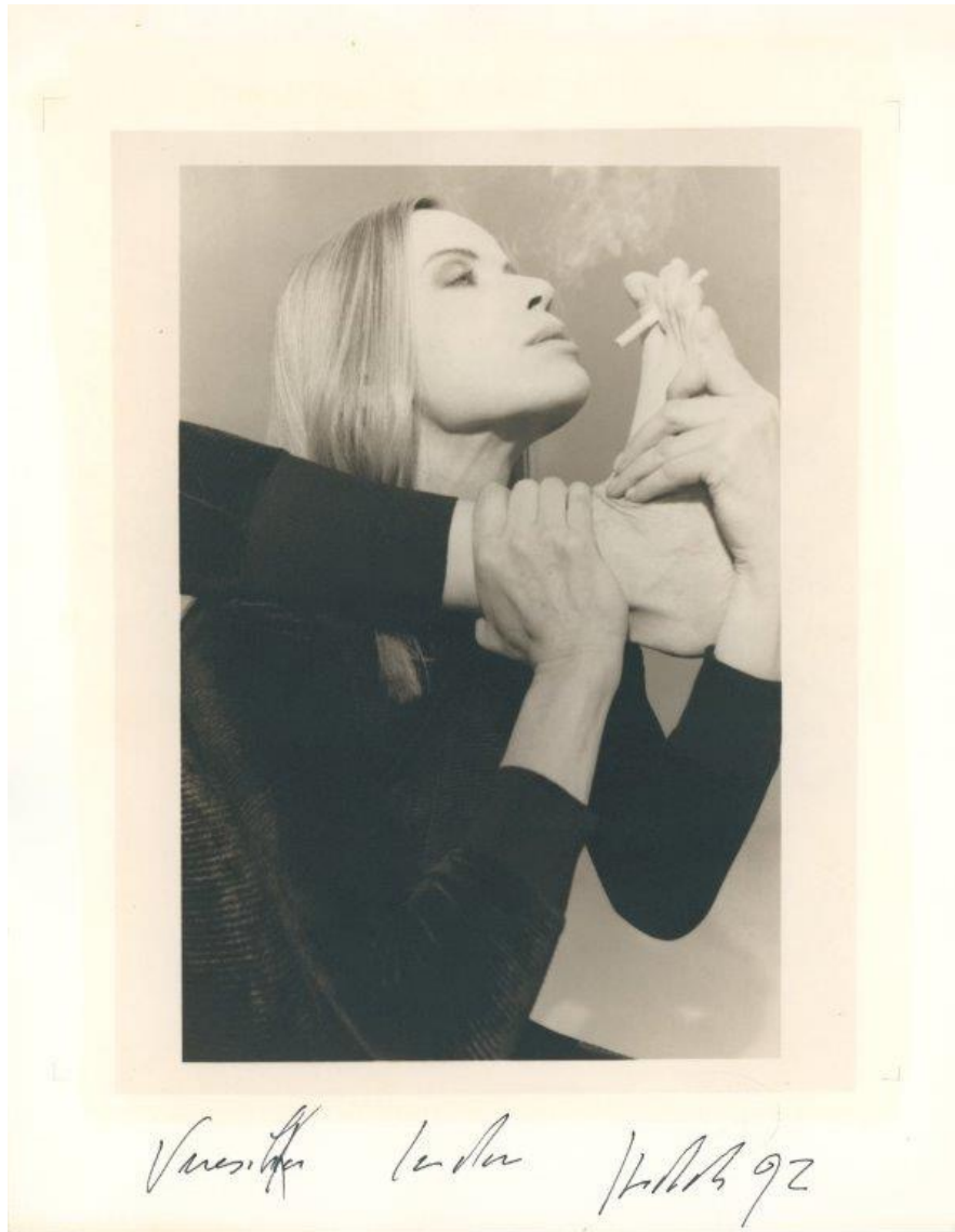
© Michel Haddi, Veruschka, London, 1992 - Courtesy of 29 ARTS IN PROGRESS gallery