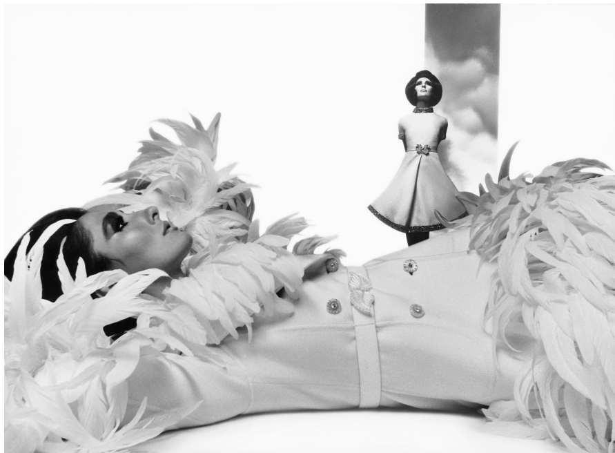
© Gian Paolo Barbieri - Alberta Tiburzi in Valentino, Vogue Italia, 1968 Courtesy of 29 ARTS IN PROGRESS gallery

The international photographers exhibited have shaped the photographic and artistic aesthetics of their time and have dedicated their lives to illustrating some of the key players in the historical and cultural changes of the last Century, from fashion photography to timeless portraits and sculptural nudes. Rare platinum prints, original contact sheets, and Polaroid photographs, regardless of the changing trends, will enchant and delight the most demanding collectors and all those interested in photography as an “intimate” and one-of-a-kind object of art crafted with unique materials by leading world-famous photographers.