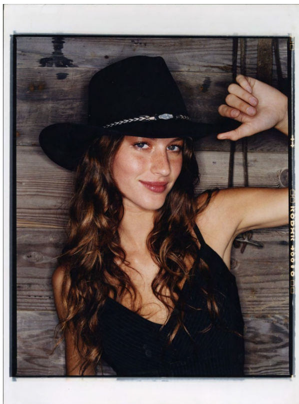
Gisele Bündchen, How The West id Worn, 1999