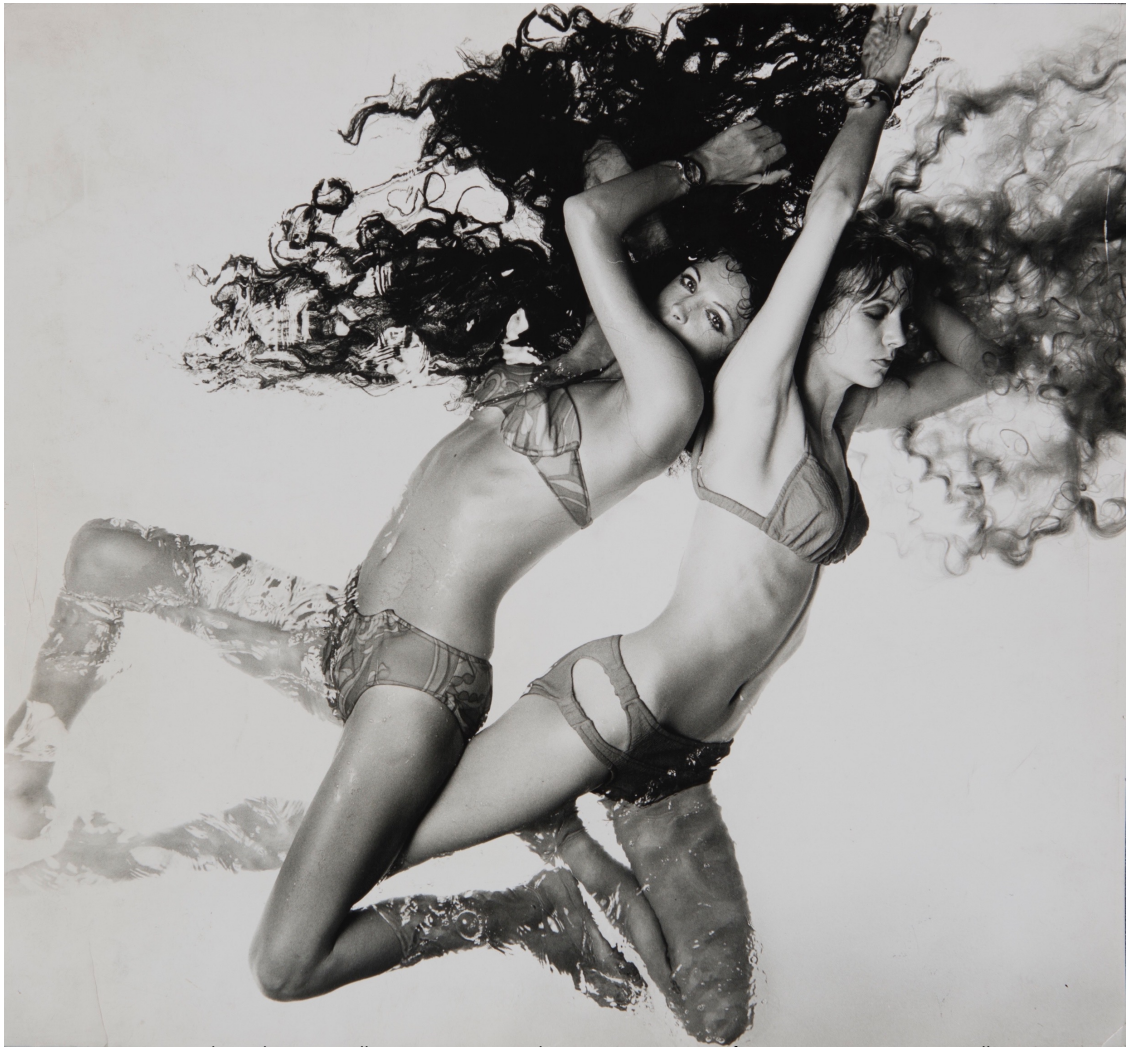
© Gian Paolo Barbieri - Mirella Petteni, Vogue Italia, 1966 - Courtesy of 29 ARTS IN PROGRESS gallery