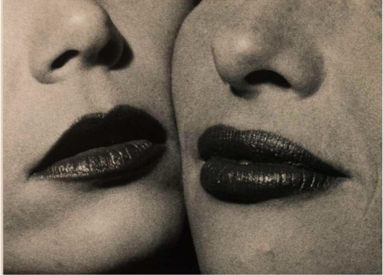
© Sylvie Blum, Lips, 2001 - Courtesy of 29 ARTS IN PROGRESS gallery