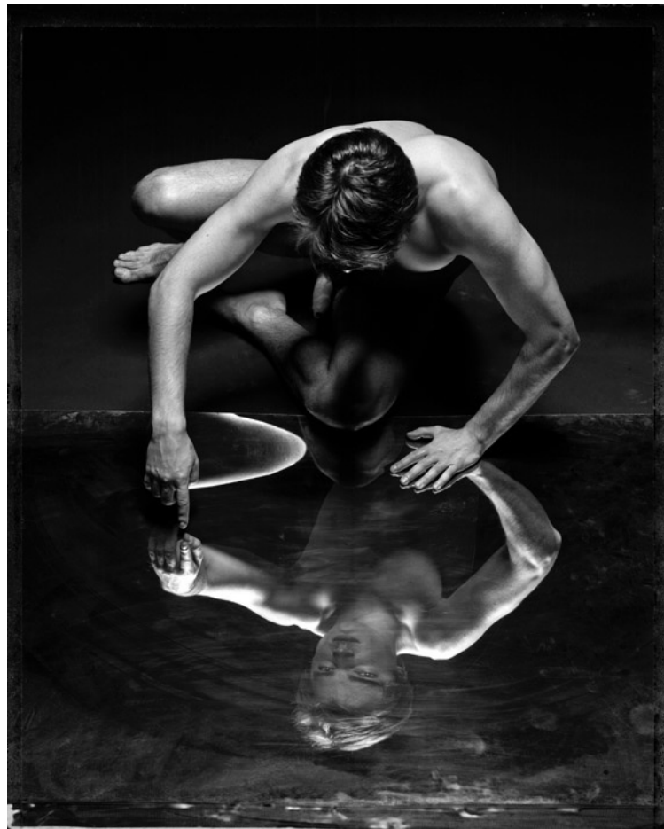
NARCISSUS, 2015 - Analog photography on Hahnemühle Fine Art Baryta 325 gr paper, cm 70x90, edition n° 1/15