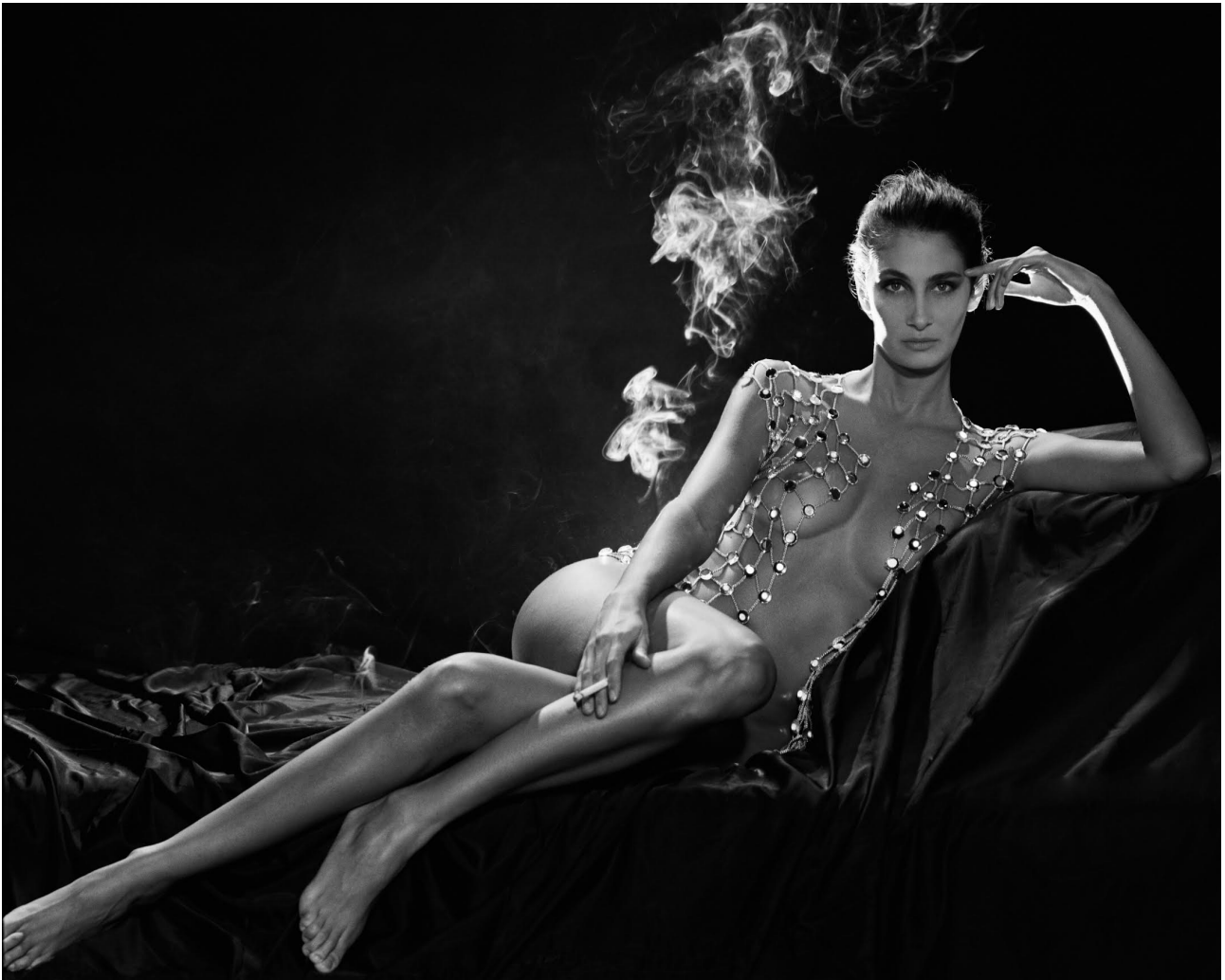
LA BELLA OTERO, 2014 - Analog photography on Hahnemühle Fine Art Baryta 308 gsm paper cm 70x90, edition n° 1/15

29 Arts in Progress presents “Gian Paolo Barbieri” at MIA Fair Milan 2015: a visual theatricality that will blot out the surroundings.