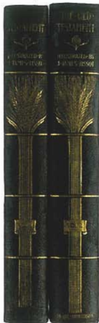
THE OLD TESTAMENT, PARIS, LONDON, NEW YORK, BRUNHOFF 1904 BROWN BINDING WITH GOLD EAR OF WHEAT ON THE SPINE & EDGED WITH GRAPE-VINE WOOD CHANEL COLLECTION, PARIS (GABRIELLE CHANEL'S APARTMENT)

Held at DDP Seoul, this exhibition examines Chanel's creative language through a retrospective on the locations that greatly inspired its founder Gabrielle Chanel. Over 500 artefacts are on display — including photographs, books, manuscripts and jewellery — to help retrace the designer's life story.