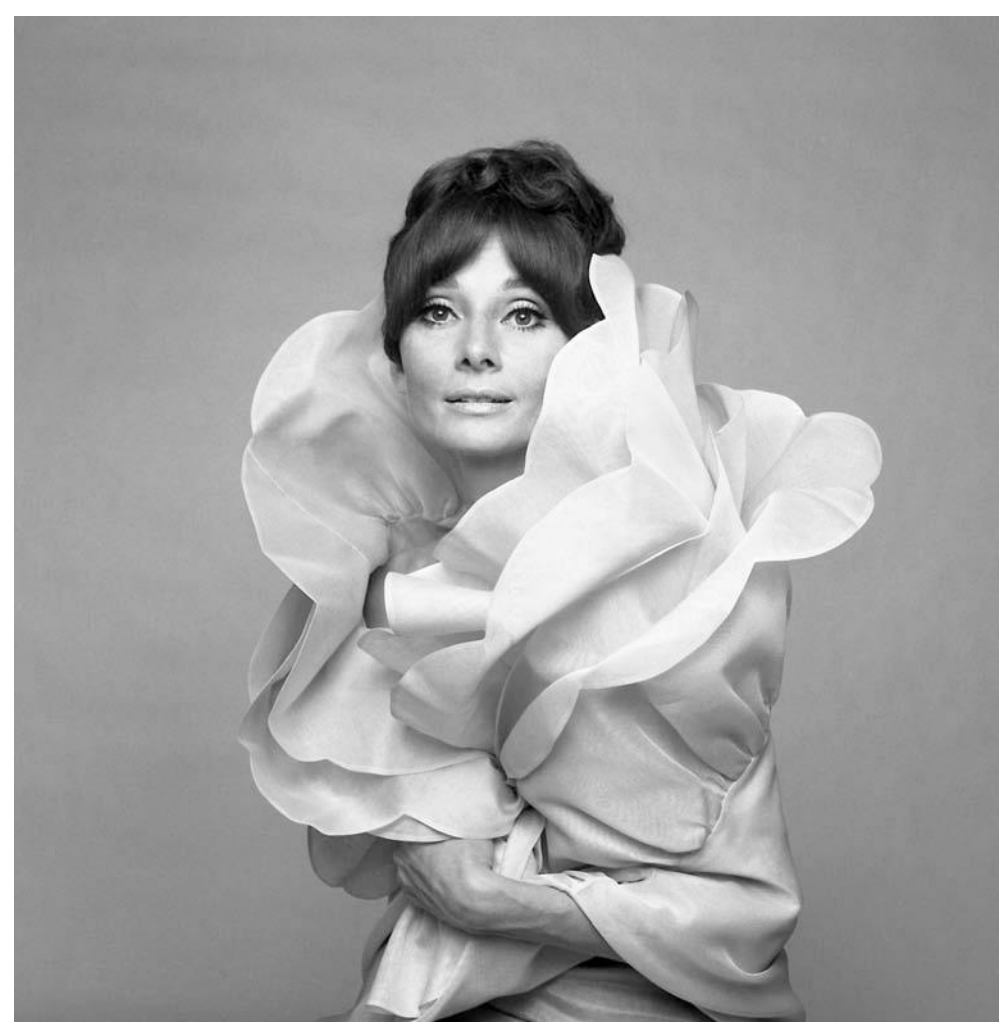
{\it Gian\ Paolo\ Barbieri, Audrey\ Hepburn, 1969, Vintage\ Silver\ Gelatin\ Photograph}