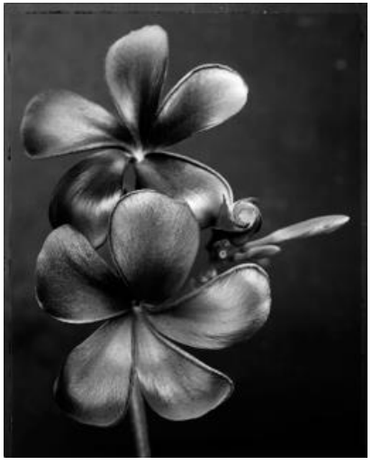
From "Fashion" Series